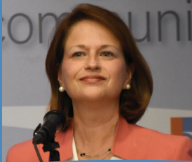
Annual Meeting cover story